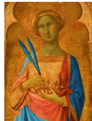
St. Corona altarpiece, c. 1350 at Statens Museum for Kunst

Learn more about Saint Corona at the link below: